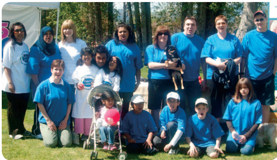
Hike participants from Bayshore's Kelowna, BC, branch.

Bayshore Home Health's branches across Canada participated in the Hike for Hospice Palliative Care for the fourth year in a row. More than 700 Bayshore staff, their family members and friends raised over $75,000. The money raised stays in each community and is donated to local hospices.