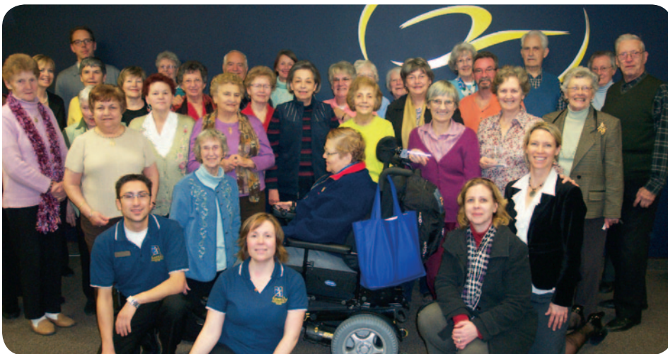
Graduates of Bayshore's first Wellness 101 course.

Bayshore Home Health recently partnered with a physiotherapy clinic in Ottawa to offer wellness workshops to seniors. Titled "60-Plus and Going Strong: Wellness 101," the series aimed to give older adults the knowledge to make healthy lifestyle choices and avoid injury.