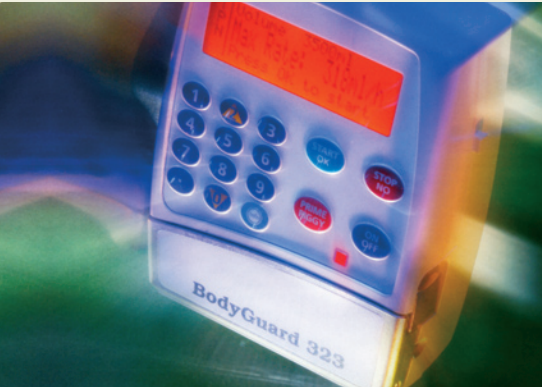
BodyGuard 323 Infusion Pump by Caesarea Medical Electronics Ltd.

Infusion pump technology that simplifies drug infusions and allows greater freedom to individuals is a key part of Bayshore Specialty Rx's commitment to improving its clients' quality of life.