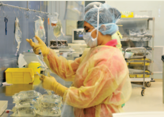
A technician inside Bayshore Specialty Rx pharmacy's clean room

Bayshore Specialty Rx's new facility features a technologically advanced "clean room" for the sterile preparation of infusible and injectable drugs.