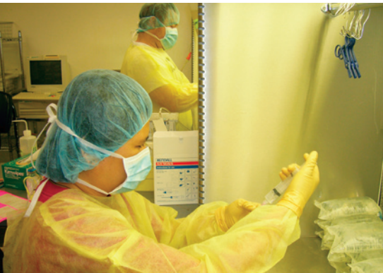
Pharmacy technicians in Bayshore Specialty Rx's clean room.

Bayshore Specialty Rx is moving its specialty pharmacy into a new home this fall. The spacious facility, located in Markham, Ont., will accommodate growing demand for a variety of specialty pharmaceutical and home infusion services the company delivers to clients such as government care programs, pharmaceutical companies and other health care organizations.