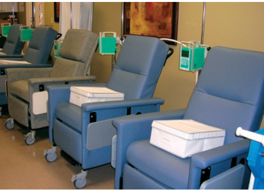
A row of infusion chairs at one of Bayshore's community care clinics.

Bayshore Specialty Rx's national network of community care clinics provides safe, convenient infusion and injection services to communities across Canada.